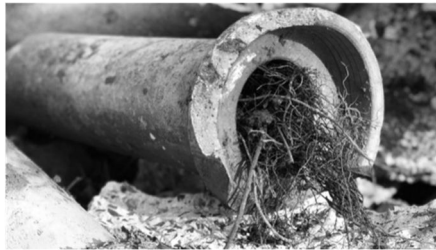
A removed section of broken crock containing tree roots .

Other types of piping can also break and allow the penetration of tree roots. We'll explore those next month.