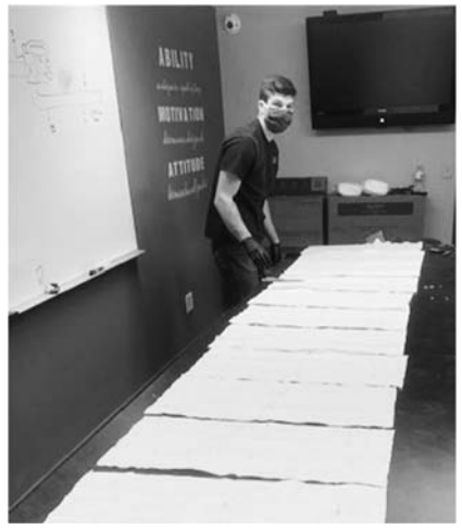
Here is 'T3' with the filter material laid out from a single Aprilaire MERV-13 filter to be cut into mask inserts that we are giving away. Filter surface area - over 28 sq.ft as shown - is the key to good air-flow in high efficiency filters. ( See article below .)

Health screening questions recommended by CDC to make certain that we weren't sending our techs into a situation in which they could be exposed to the Coronavirus which in turn could be spread to other clients and to the tech's family,