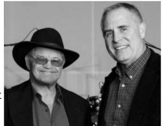
Here I am with original Monkee band member Mickey Dolenz after a concert.

So it was really cool for me to attend a seminar in November that featured entertainment by one of the original Monkees, Mickey Dolenz. Dolenz, who's voice gave the Monkees their distinct sound, was backed up by a