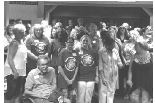
Here I am at my 40 year high school reunion. It's hard to tell in the picture, but I am the tall guy in the back row, center.