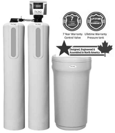
Hardness, Taste & Odor - softener eliminates hardness and carbon filter eliminate chlorine to give you healthy 'working water'.