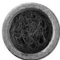
Root Clogged Pipe

Classified as a General Use Product by the EPA (EPA reg.# 68464-1), as oppose to Restricted Use, RootX® can be used in both sanitary and storm pipe without adversely affecting the environment