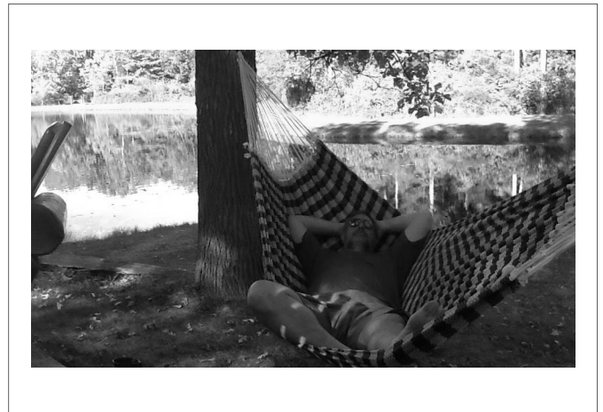
Physical Therapy was rough after my procedure. Here I am, hard at it.

This year has been one of challenges as one of my office staff members required extended medical leave time to get through a rough time. Thank God, everything is now okay, but there was a lot of extra work that had to be